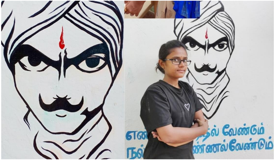
Village Extension Programme