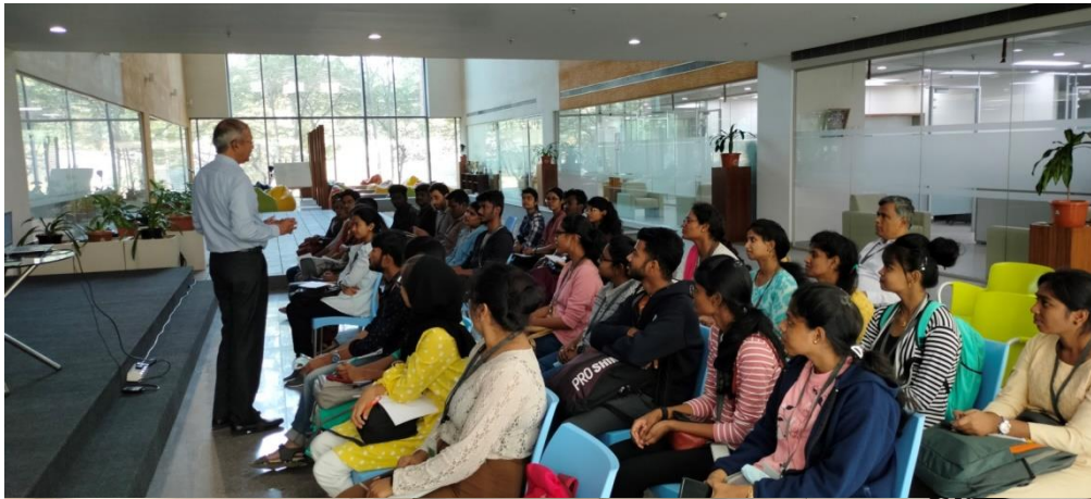
M. Sc. Students and Ph. D. Scholars attended Genomics India Conference (GIC-2023) and also visited ITC-LSTC, Bangalore and interacted with Scientist at ITC during 01-03 rd February 2023