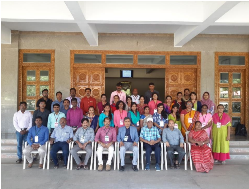
Genomics and proteomics workshop conducted by Department of Biotechnology on 07 th February 2019