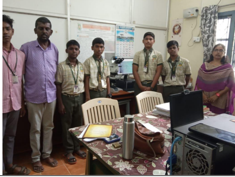
Department instrumentation lab