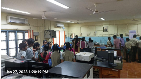
Library - RFID facility