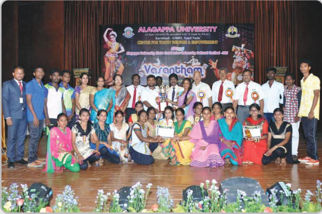
State-Level Inter University Cultural Festival Held at Alagappa University from 10.03.2017 to 12..03.2017