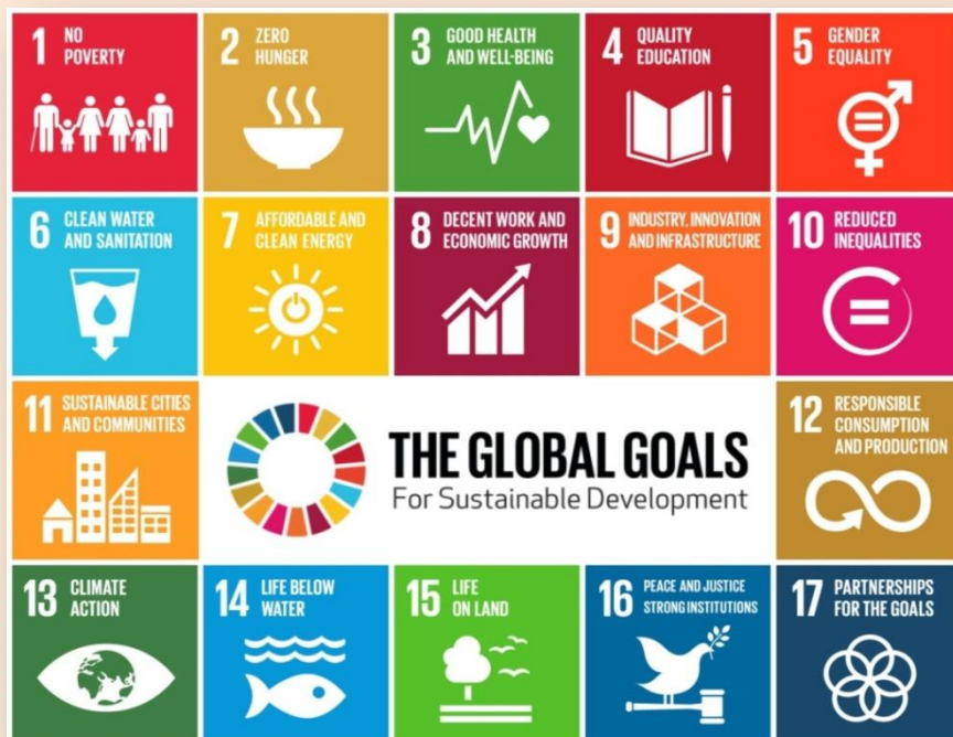
Fig. Sustainable Development Goals

These 17 Goals build on the successes of the Millennium Development Goals, while including new areas such as climate change, economic inequality, innovation, sustainable consumption, peace and justice, among other priorities.