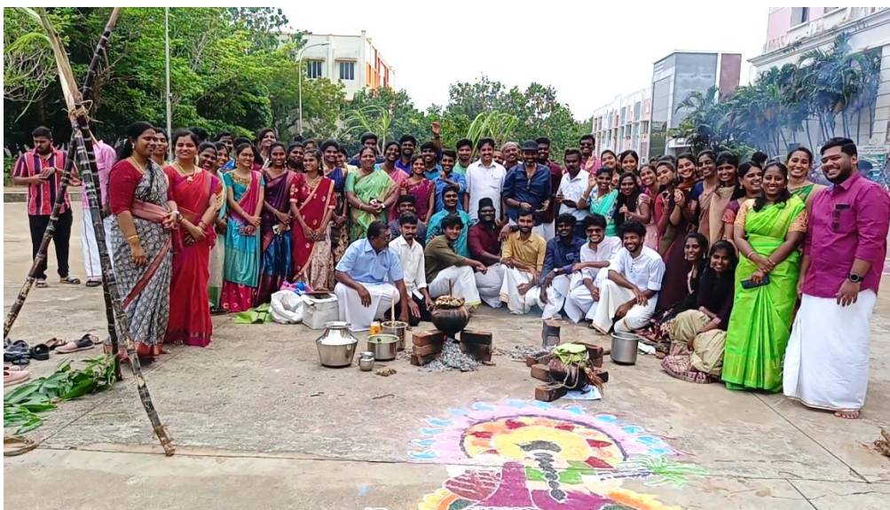
Pongal celebration on 12.02.2024 Pongalomics 2024