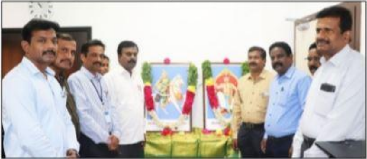
University Officials Paying tribute to the late Sivaganga queen and freedom fighter Velunachiar on the occasion o her birthday celebration.