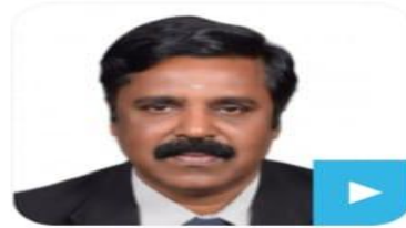
Alagappa CR 25-.. Alagappa University ALAGAPPA CR -JA..