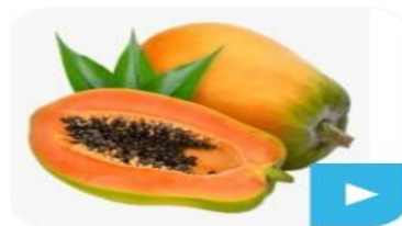
Alagappa CR 26-..