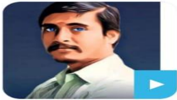
Alagappa CR 26-.. Alagappa University ALAGAPPA CR -JA..