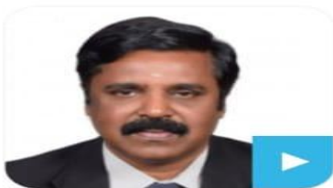
Alagappa CR 24-..