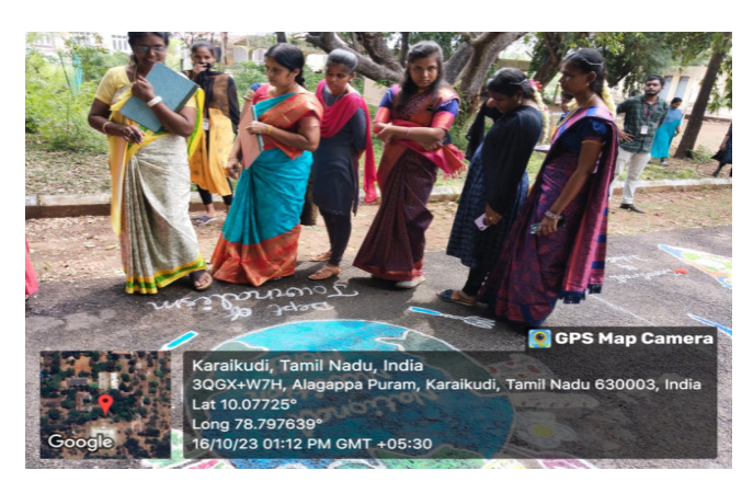
16 Days of Activism to Raise Awareness And Prevent Violence Against Women And Girls - 2023

significance of physical activity and exercise in maintaining a healthy lifestyle