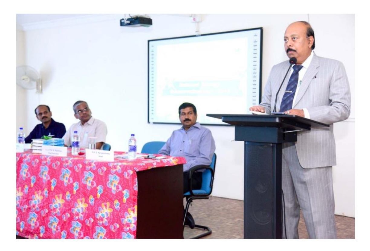
National Energy Conservation Day-2018