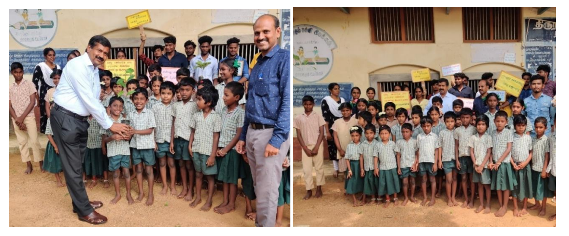
Village Extension Programme (2022)-Kandramanickam Village