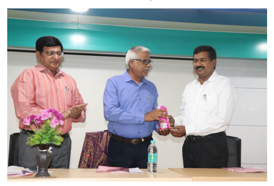
National Seminar on Renewable Energy Science and Technology (NSREST-2022) held on March 22, 2022.