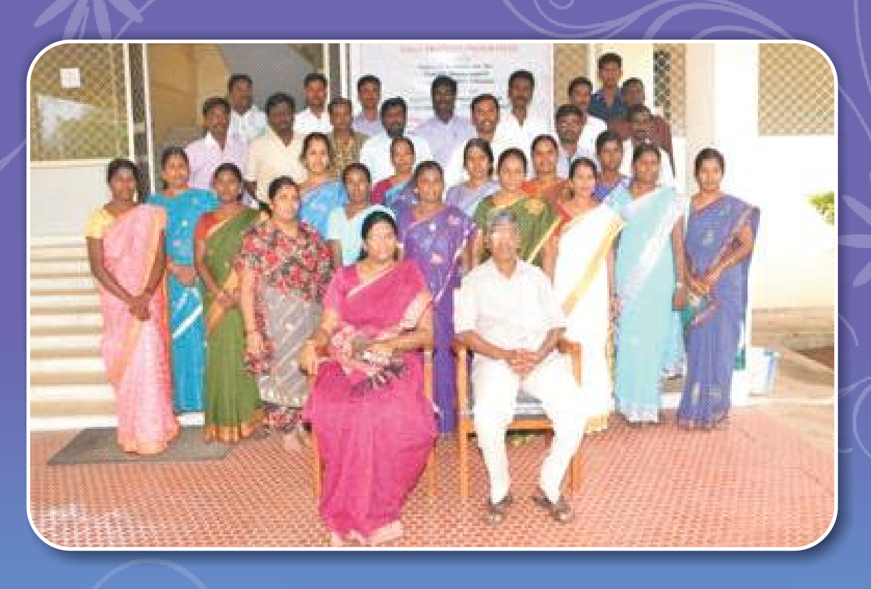
Orientation Programme to the Visually Impaired