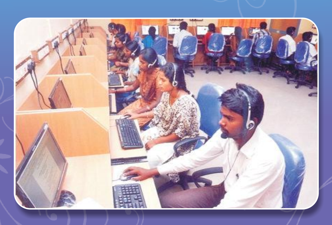
The students benefit by practising the skills in the Language Lab.