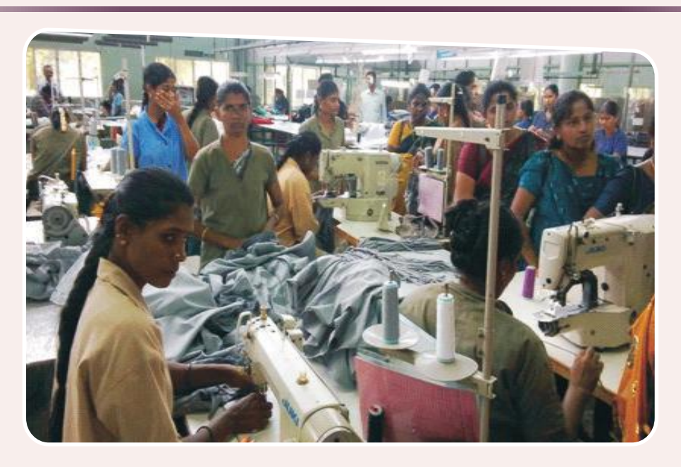
Industrial Visit of the Entrepreneurship Trainees at Coimbatore & Tiruppur

environment day address. In his address, he elaborated how a single woman by name Gowra Devi led thousands of women in the Sub-Himalayan region, to protest against the felling of trees ordered by the U.P. Government. He added that the trees were the main source of livelihood for the rural masses in India and emphasized the great responsibility of every citizen to protect environment from degradation. He emphasized the people's real participation and not simply the Government's implementation that is needed in the environmental campaign today. Dr. P. Manisankar, Head of the Department of Industrial Chemistry, offered felicitations. Dr. H. Gurumallesh Prabu, Coordinator, Environmental Awareness Club, proposed a vote of thanks.