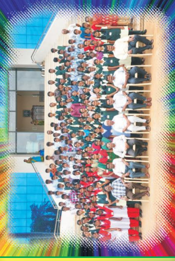
Participants at the International Conference on Computing and Information Technology