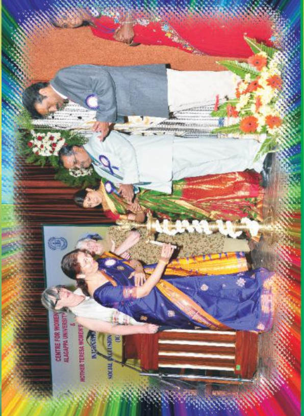
International Conference on Social Exclusion and Inclusion of Women