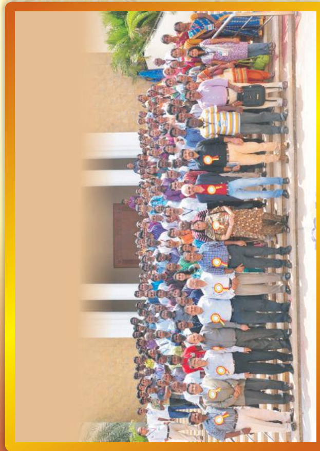
Participants at the 6 th National Symposium - cum - Workshop on "Recent Trends in Structural Bioinformatics and Computer Aided Drug Design" SBCADD-2014