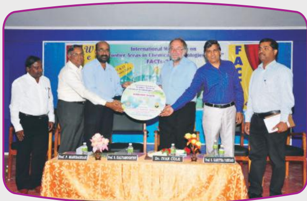
Release of Manual at the International Workshop on Frontier Areas of Chemical Technologies 2014 (FACT 2014)