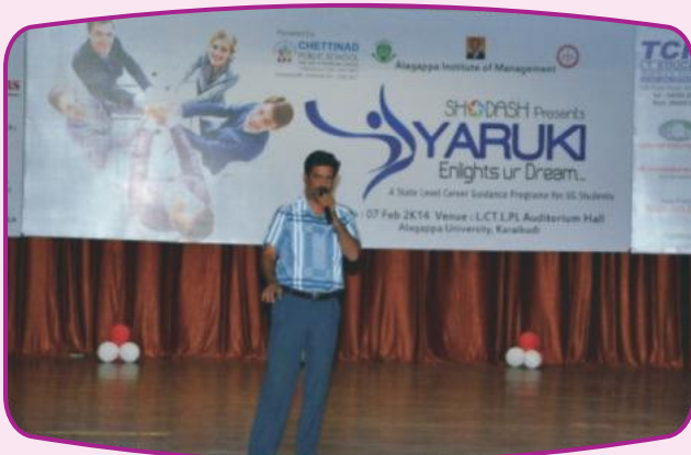
YARUKI – a career guidance program for the under-graduates was organised on 07.02.2014.