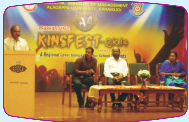
KINSFEST an inter-school competition event was conducted on 14.02.2014