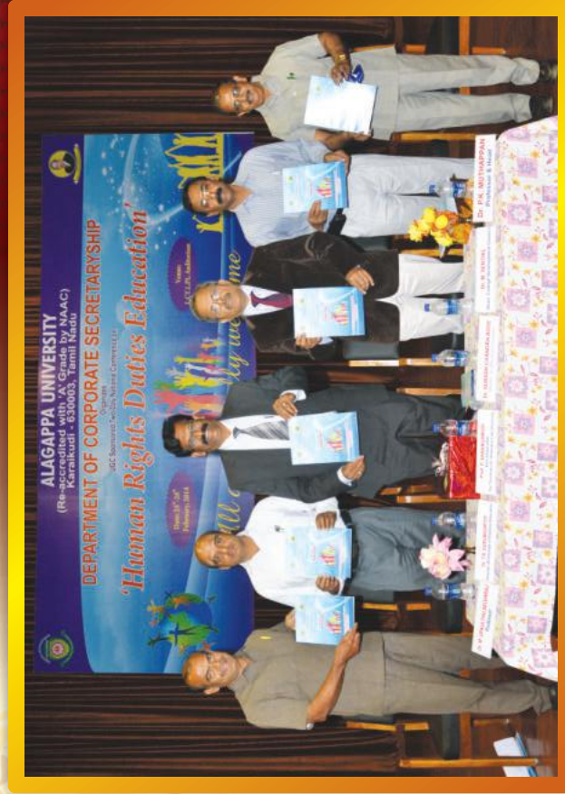
Release of souvenir at the National Conference on "Human Rights Duties Education"