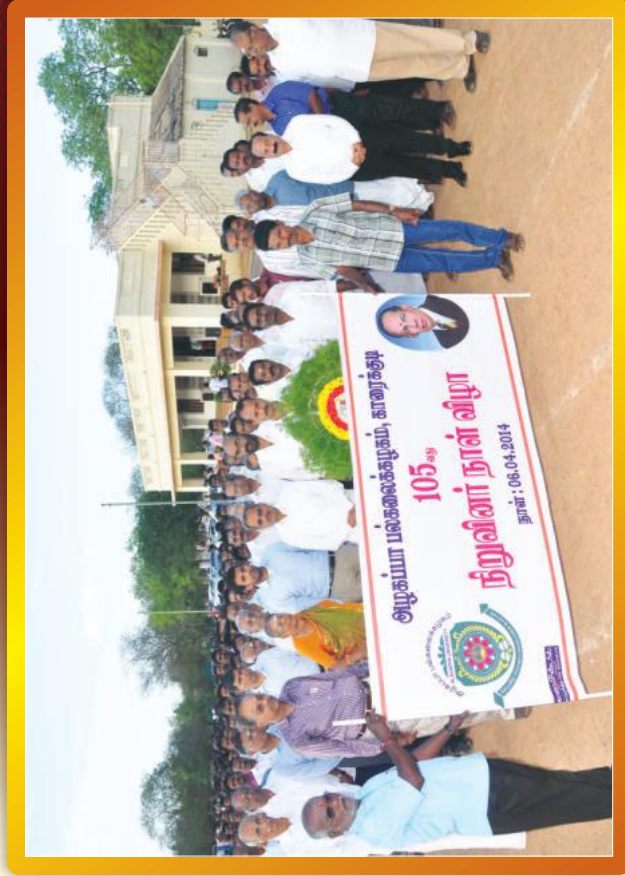
105 th Founder's Day Celebrations