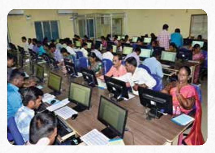
Participants from Affiliated Colleges at "Kanithamizh Peravai"