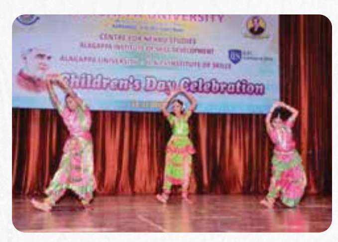
A Dance Programme at Children's Day Celebrations