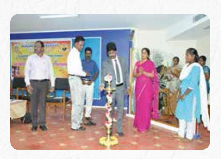
Lighting ceremony at the Soft Skill Communicative Training