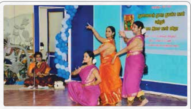
A dance demonstration at the World Music Day

More than 100 participants - agricultural scientists, teachers and researchers from Agricultural University and its Research Stations and Tamil enthusiasts - involved themselves in the workshop.