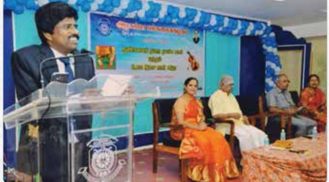
World Music Day Celebrations

The World Music Day was celebrated at Alagappa University on 21.6.2016 at the University