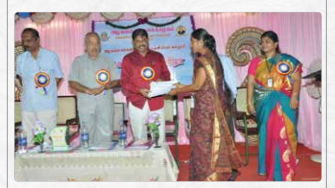
66th Annual Day of Alagappa University College of Education