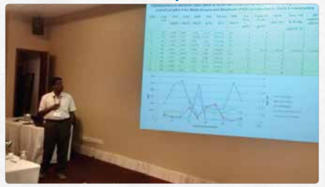
Events of Importance