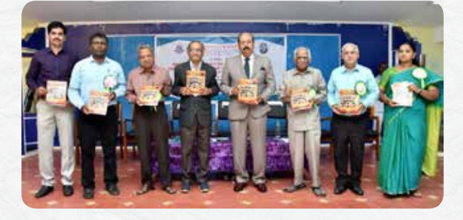
The inaugural function of a Two-Day National Conference on "Critical Approaches: East and

West and Their Application to Literature" was held on 17.12.2018 at Alagappa University, Karaikudi. Sponsored under the aegis of the Department of English and Foreign Languages, the conference was attended by 250 delegates.