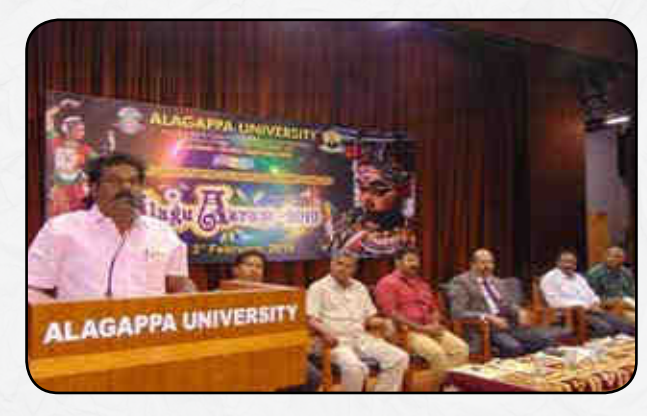
அழகு ஆரம் - 2019

காரைக்குடி அழகப்பா பல்கலைக்கழக கலைமன்றத்தின் (Cultural Club) சார்பில் அழகப்பா பல்கலைக்கழக இணைப்புக் கல்லூரிகளுக்கிடையேயான மாணவர்களின் கலைத்திறன்களை வெளிகொணர்தலுக்கான இரண்டு நாள் போட்டிகளின் (அழகு ஆரம் 2019)