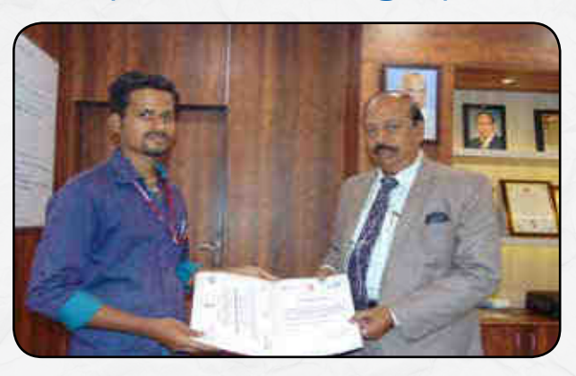
2019-ஆம் ஆண்டிற்கான தேசிய இளையோர் பாராளுமன்றம்

2019-ஆம் ஆண்டிற்கான தேசிய இளையோர் பாராளுமன்றம், கடந்த பிப்ரவரி மாதம் 26 மற்றம் 27-ஆம் தேதிகளில் புதுடெல்லியிலுள்ள டாக்டர். அம்பேத்கர் சர்வதேச மையத்திலும், விக்யான் பவனிலும் நடைபெற்றது.